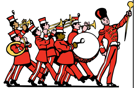
Be in the Parade!