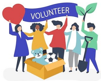
Volunteer with us!