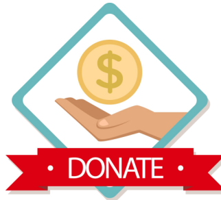
Help fund all the fun

For applications & more information, contact nlparksrec@newlebanonoh.org .